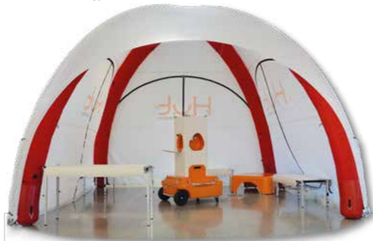
As an all-in-one system, the Hut' turns into a complete reception area